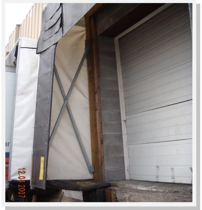
Inside view of the X frame with bottom draft cushion.

Steel I beams bumpers to protect the truck from damaging the shelter. (Optional)